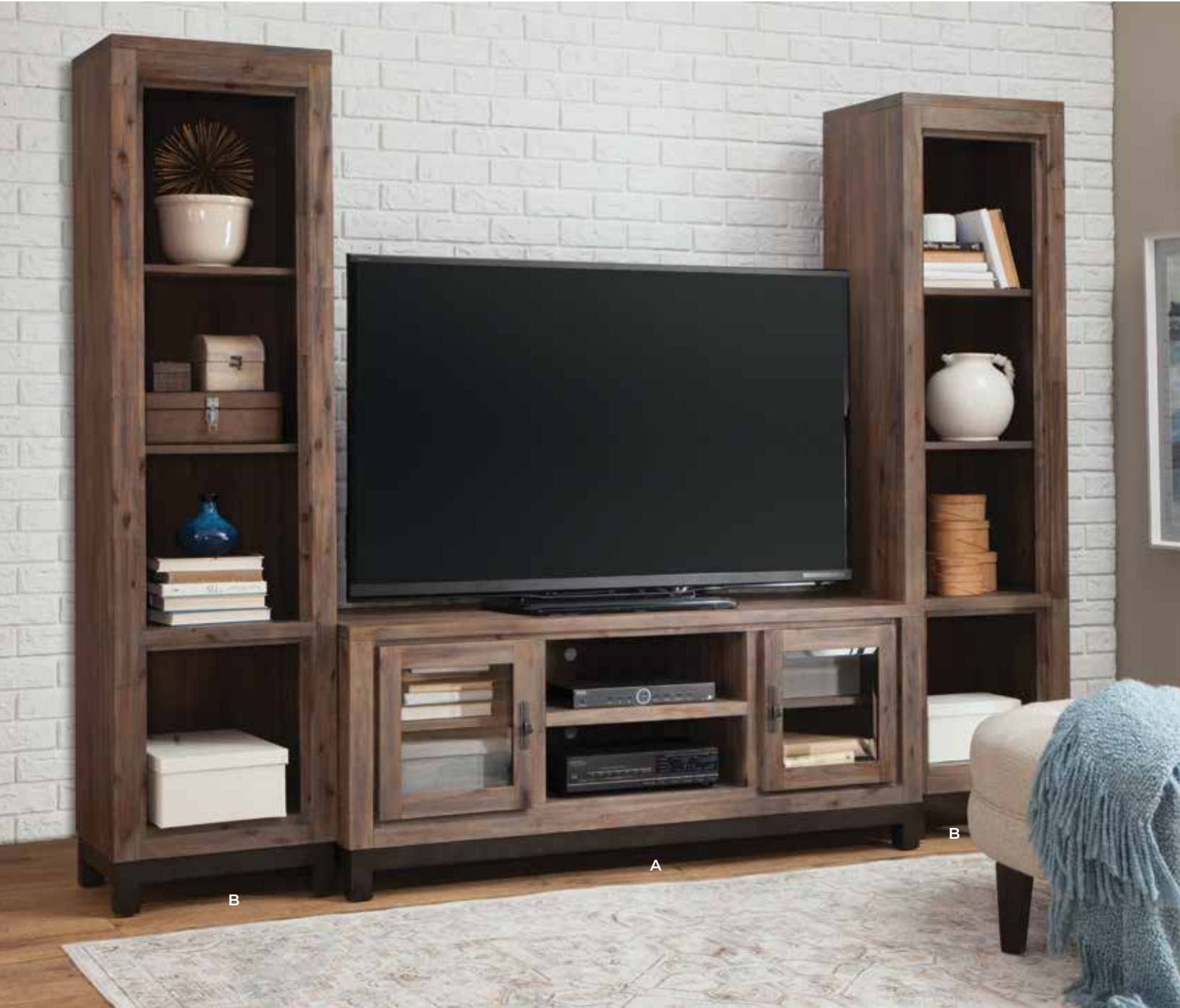
A / 60" CONSOLE IMLA360 - 60w x 24h x 16d Three adjustable shelves, Accommodates most TV's up to 70"

Laredo combines classic lines with ample storage for all your home entertainment components. Constructed with solid lumber and veneers to ensure lasting strength and stability. A distressed warm caramel finish creates a gentle aged appearance that highlight the woods natural grain and patina.