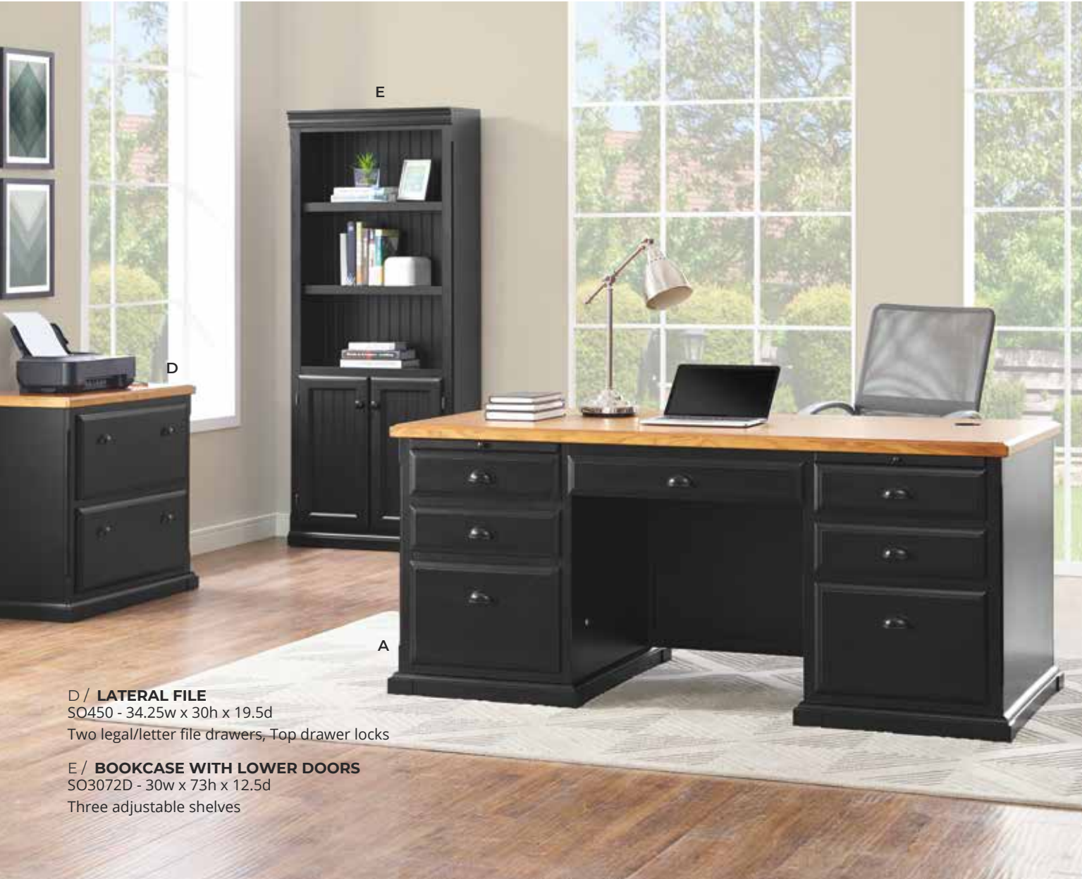
D / LATERAL FILE SO450 - 34.25w x 30h x 19.5d Two legal/letter file drawers, Top drawer locks