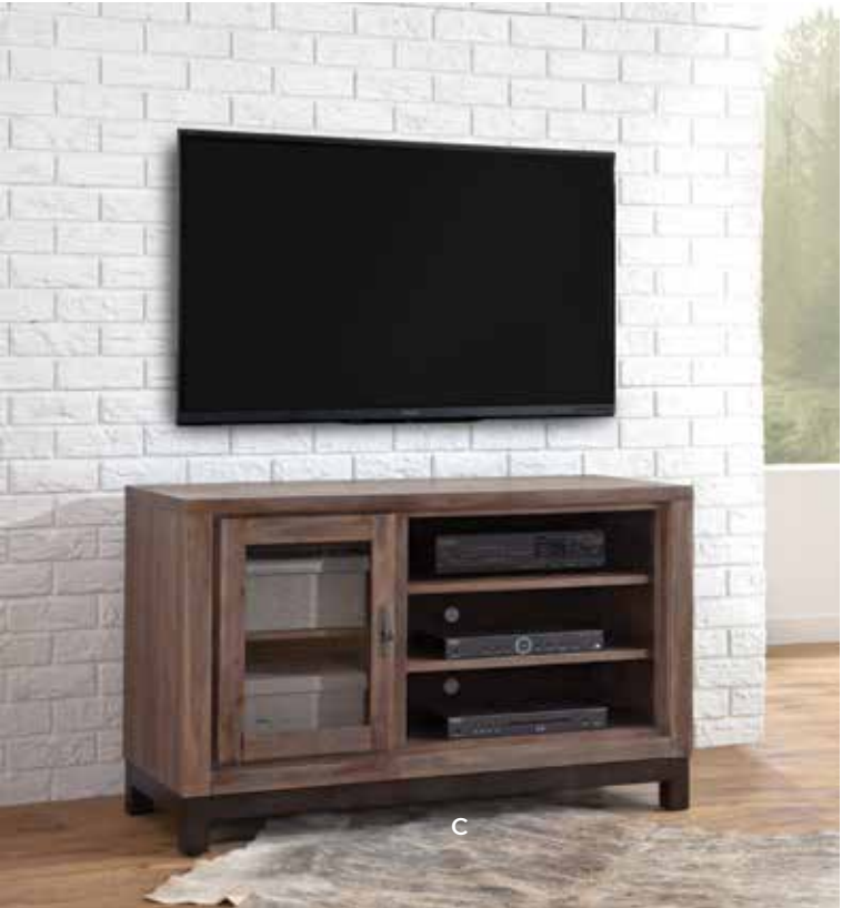
C / 46" CONSOLE IMLA340 - 46w x 28h x 16d Three adjustable shelves, Accommodates most TV's up to 50"