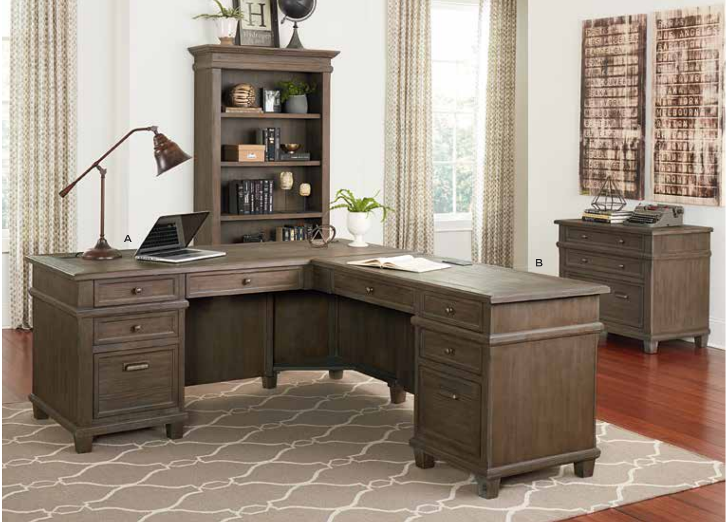
A / RETURN DESK* IMCA684R - 68w x 30h x 28d Drop front keyboard/pencil drawer, Two utility drawers, One locking letter/ legal file drawer, Two wire management grommets, Finished on all sides