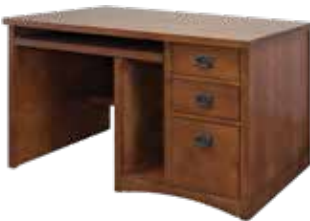
SINGLE PEDESTAL COMPUTER DESK MP540 - 55.5w x 29h x 24.5d One letter file drawer, Keyboard pull-out, Two utility drawers