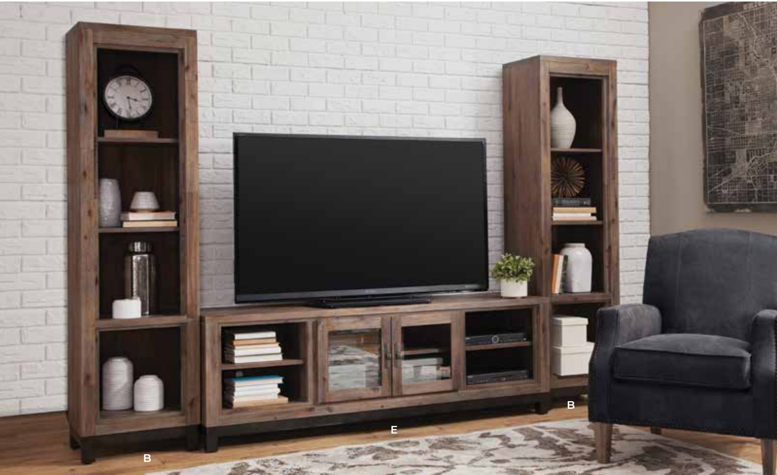
E / 72" CONSOLE IMLA370 - 72w x 24h x 16d Four adjustable shelves, Accommodates most TV's up to 80"