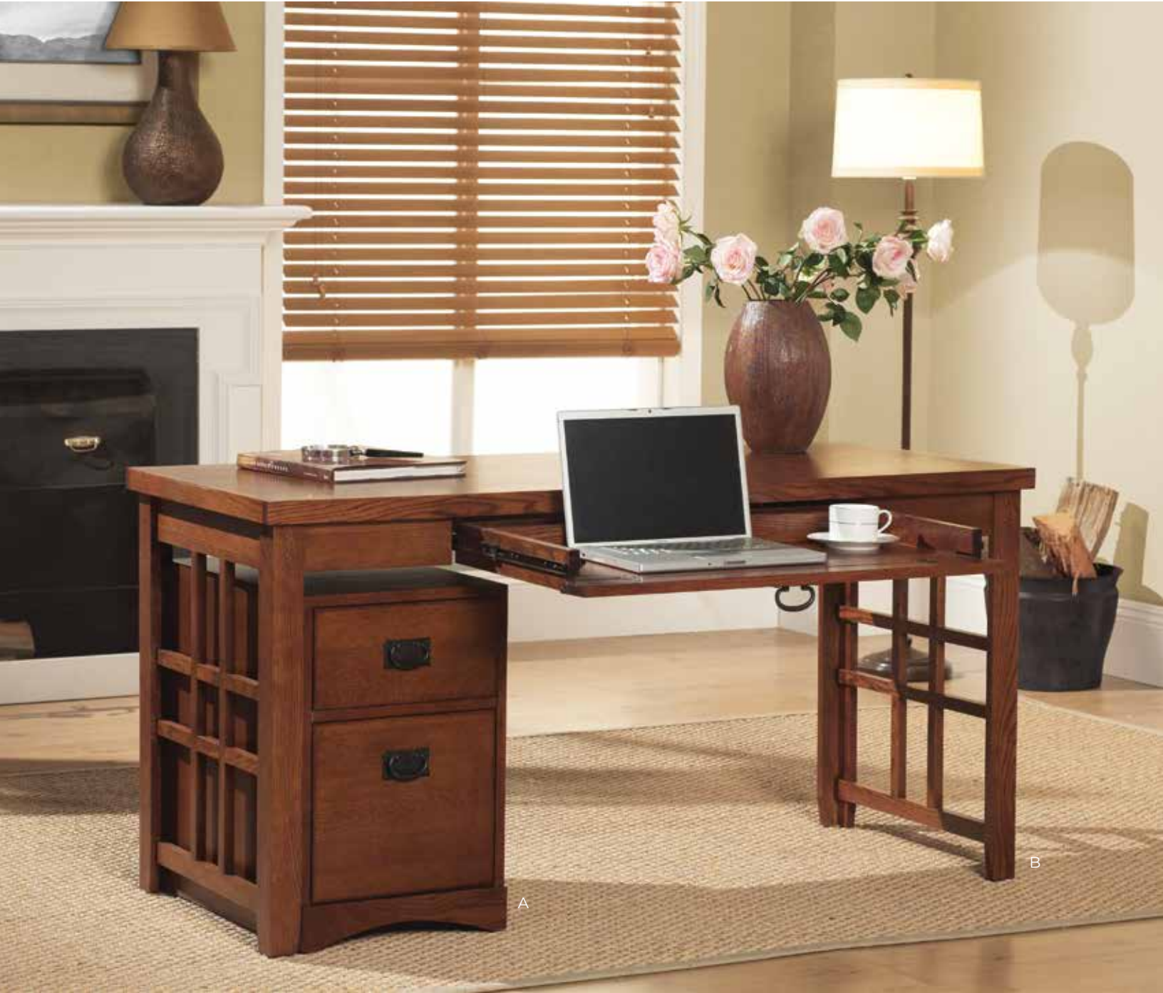
A/ ROLLING FILE MP202 - 15.5w x 23.5h x 22.5d One letter file drawer, Utility drawer, Casters included

Mission Pasadena combines turn-of-the-century mission design with rustic simplicity. The glow of natural wood complemented by the mission-inspired finish and decorative structures make this collection a comfortable addition to any office.