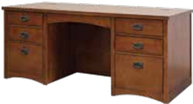
DOUBLE PEDESTAL DESK MP680 - 68.25w x 29h x 32d Two legal/letter file drawers (left drawer locks), Four utility drawers with dividers, One pencil drawer, Two wire management grommets, Finished back