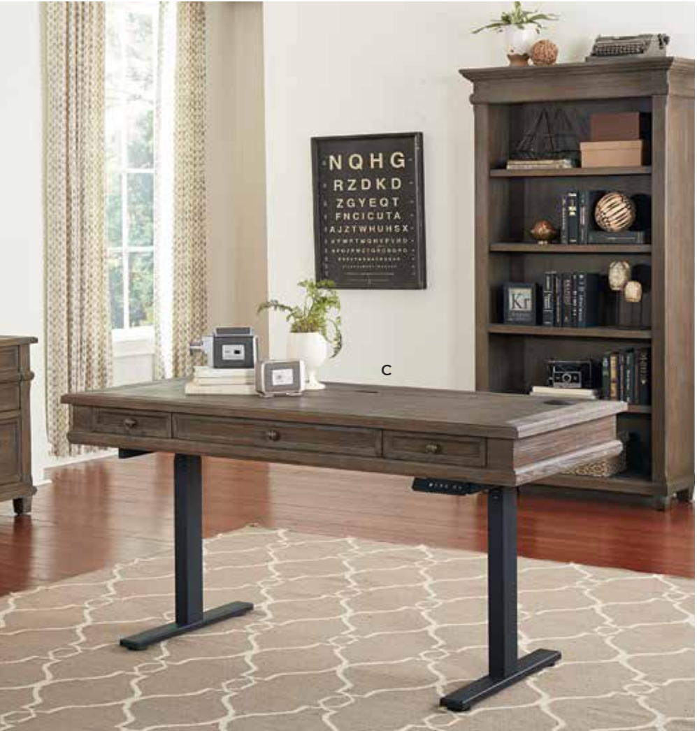
C / ELECTRIC SIT/STAND DESK IMCA384T - 60w x 30h x 28d Dropdown keyboard/pencil tray, Two utility drawers, Power center with two AC power outlets & three USB 2.0, Charging shelf accommodates phones and tablets, Finished on all sides 384EB Electronic height adjustable memory settings ~(30-45")