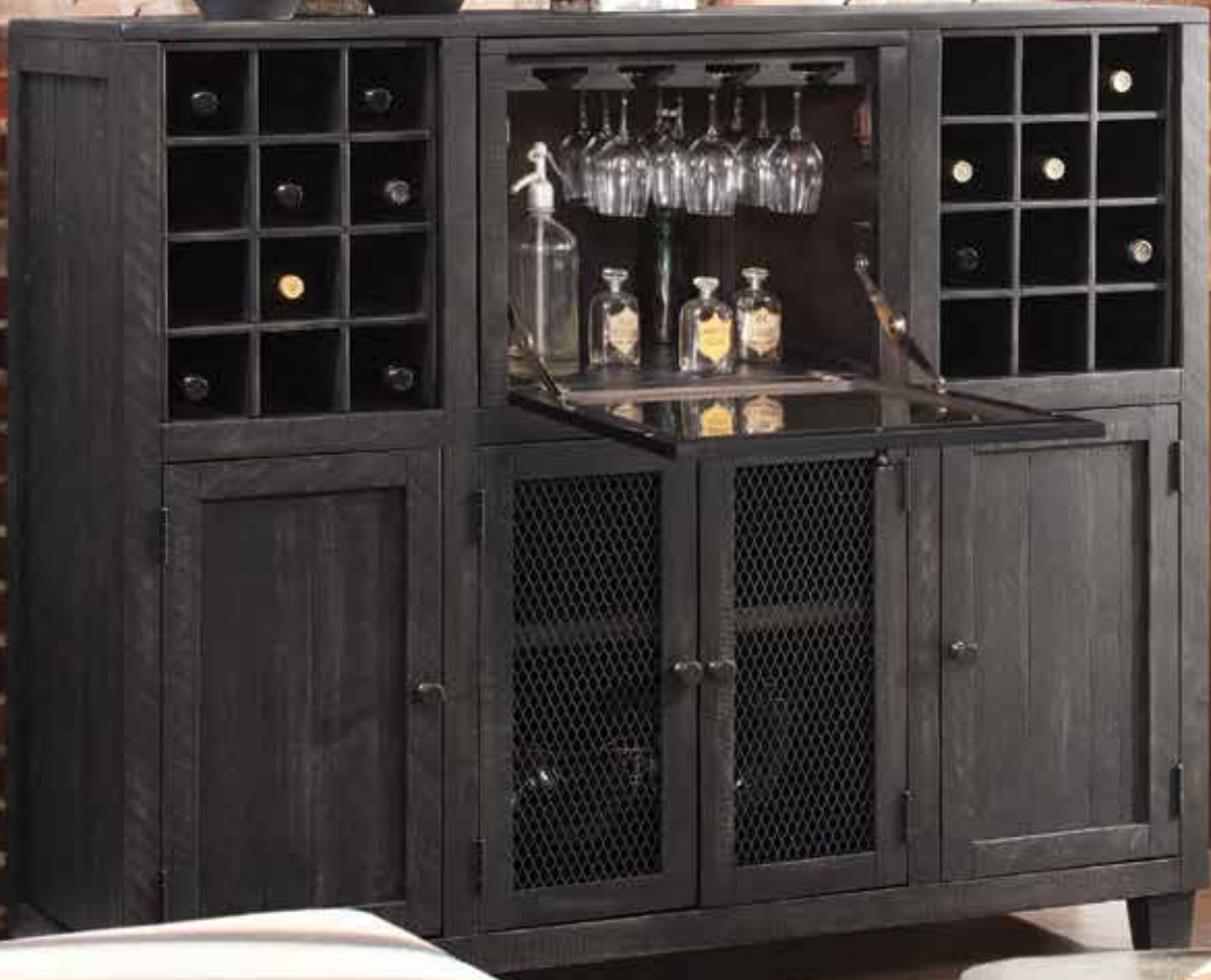
WINE CABINET IMCP300 - 58w x 50h x 18d Adjustable shelf behind wood panel doors, Adjustable shelf behind wire mesh panel doors, Drop down glass and mesh door opens to bar service area with wine glass storage rack behind, Two side cubbies with removable bottle storage

Cooperstown is a solid wood collection that emanates industrial simplicity. Its rough sawn planks, captured end panels, inset wire mesh, and soft bronze hardware combine to create furniture that is easy to live with and a pleasure to own.