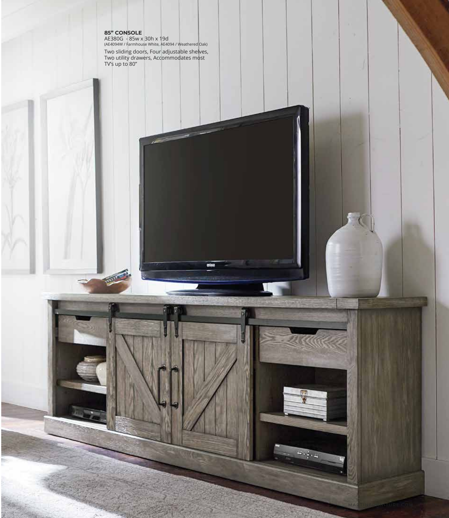
85" CONSOLE AE380G - 85w x 30h x 19d (AE4094W / Farmhouse White, AE4094 / Weathered Oak) Two sliding doors, Four adjustable shelves, Two utility drawers, Accommodates most TV's up to 80"