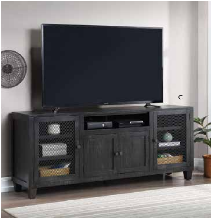
A / 60" CONSOLE IMCP360 - 60w x 30h x 18d Adjustable shelf behind wood panel doors Three utility drawers, Accommodates most flat screen TVs up to 65"