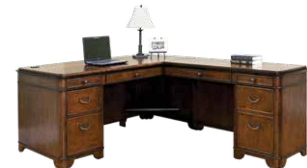
DESK FOR RIGHT HAND FACING RETURN* IMKE684R - 68w x 31h x 32d Drop front keyboard/pencil drawer, Two utility drawers, Legal/letter file drawer, Two wire management grommets