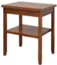
CORNER GROUP TABLE MP55 - 25w x 30h x 19.5d One removable shelf, Requires minor assembly