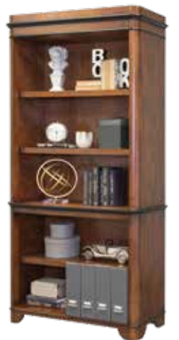
BOOKCASE IMKE3776 - 37.5w x 76h x 15d Three adjustable shelves