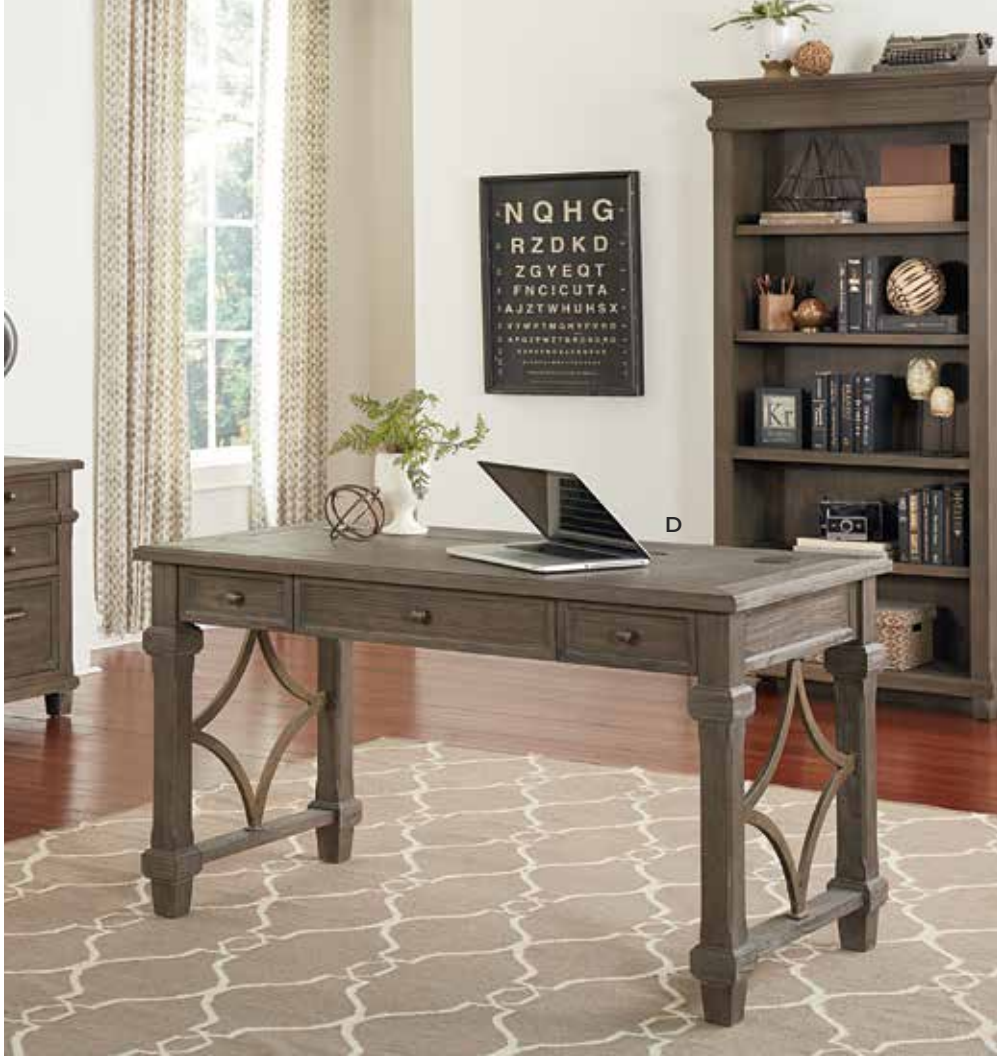
D / WRITING DESK IMCA384 - 54w x 30h x 27d Drop-down keyboard/pencil tray, Two utility drawers, Power center with two AC power outlets & three USB 2.0, Charging shelf accommodates phones and tablets, Finished on all sides