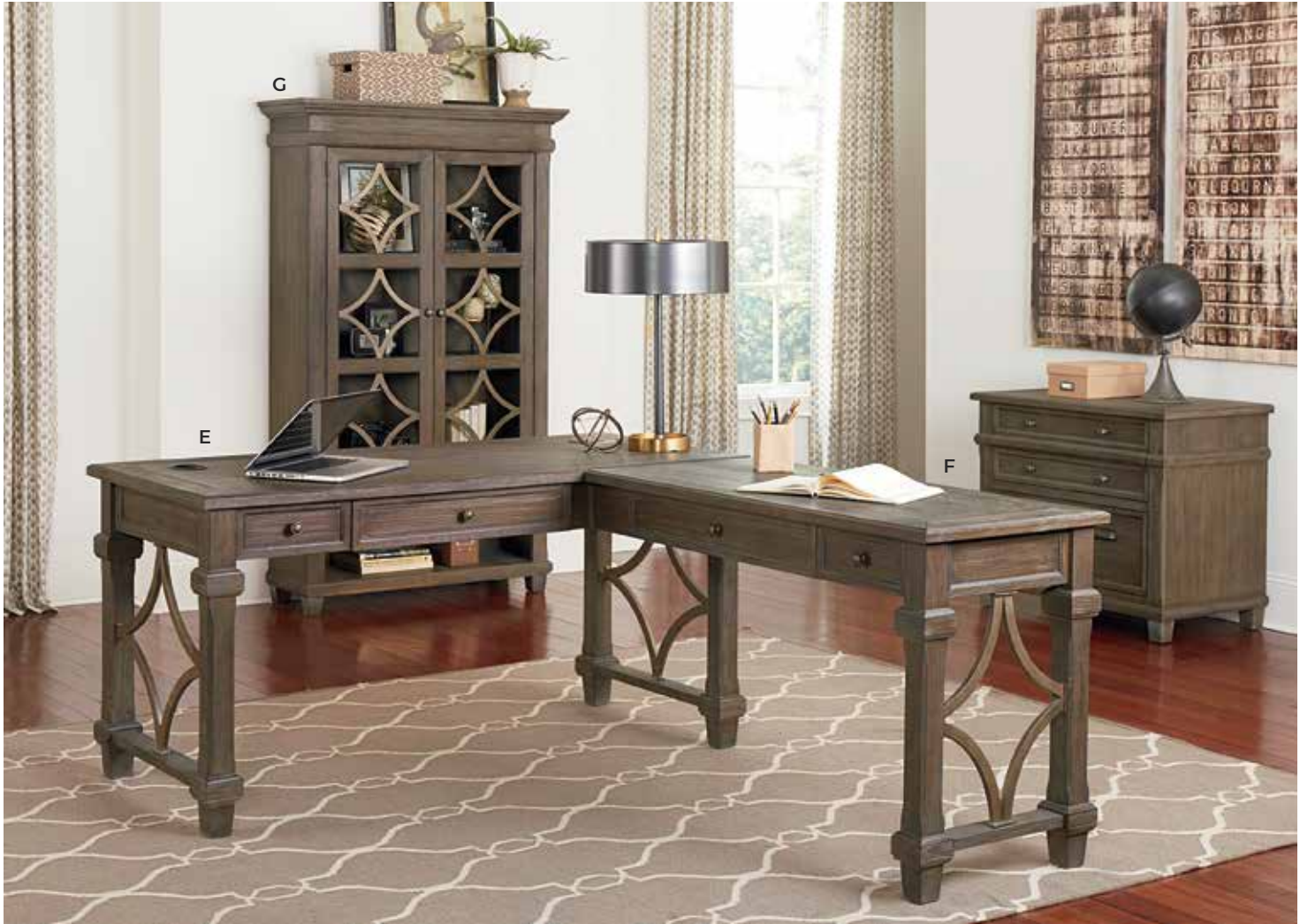
G / GLASS DISPLAY CABINET IMCA4270 - 42w x 70h x 15d Two adjustable shelves