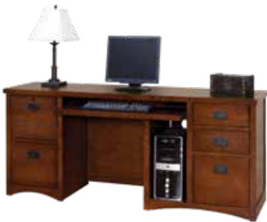
COMPUTER CREDENZA MP689 - 68.25w x 29h x 19.5d Pull-out keyboard tray, Three letter file drawers (top left drawer locks), Wire management grommet, Power Management Center, Two utility drawers