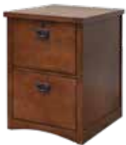
TWO DRAWER FILE MP201 - 21.25w x 29h x 24.5d Two legal/letter file drawers, Top drawer locks