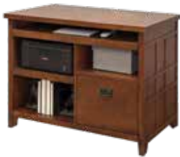
INTERNET CREDENZA MP387 - 42w x 30h x 19.5d Pull-out printer & laptop trays, One legal/letter file drawer, Wire management grommet