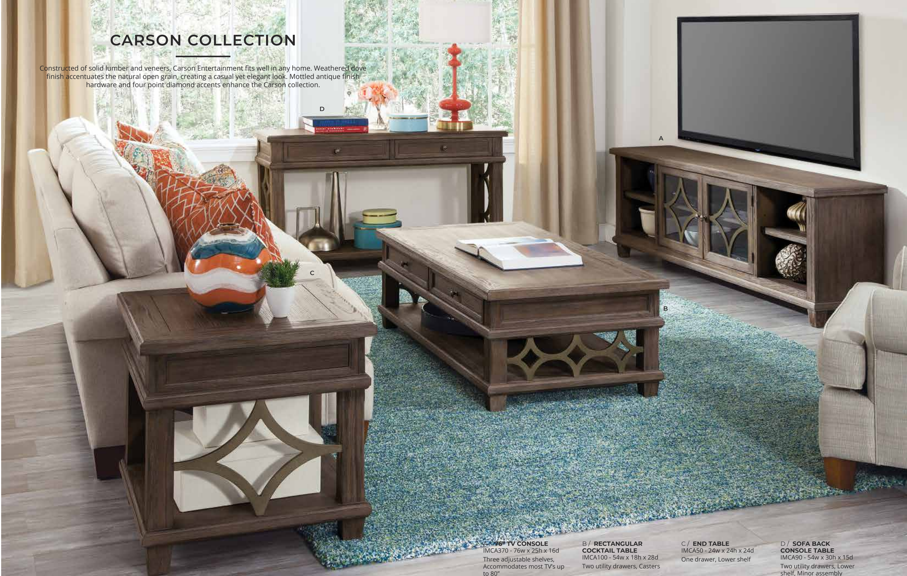
A / 76" TV CONSOLE IMCA370 - 76w x 25h x 16d Three adjustable shelves, Accommodates most TV's up to 80"

MARTIN FURNITURE ENTERTAINMENT COLLECTIONS