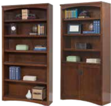
BOOKCASE MP3672 - 36w x 72h x 12.75d Four adjustable shelves