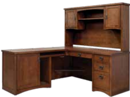
STORAGE HUTCH MP682 - 64w x 36h x 11d Three adjustable shelves, Fits on MP684L/R