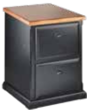
TWO DRAWER FILE SO201 - 23w x 30h x 24.5d Two legal/letter file drawers, Top drawer locks