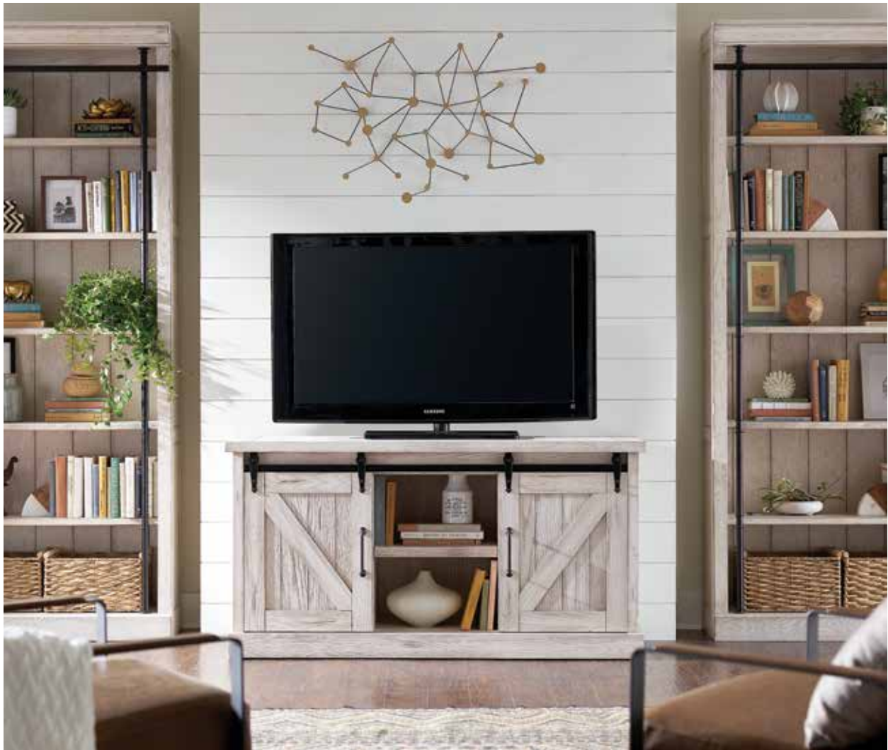
CONSOLE AE360 - 60w x 31h x 19d (AE360W / Farmhouse White, AE350G / Rustic Gray) Two sliding doors, Three adjustable shelves (Shown above in Farmhouse White)