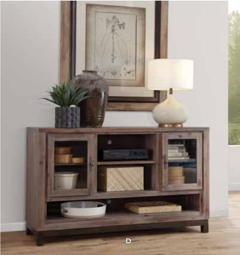
D / 60" DELUXE CONSOLE IMLA365 - 60w x 36h x 16d Three adjustable shelves, Accommodates most TV's up to 70"