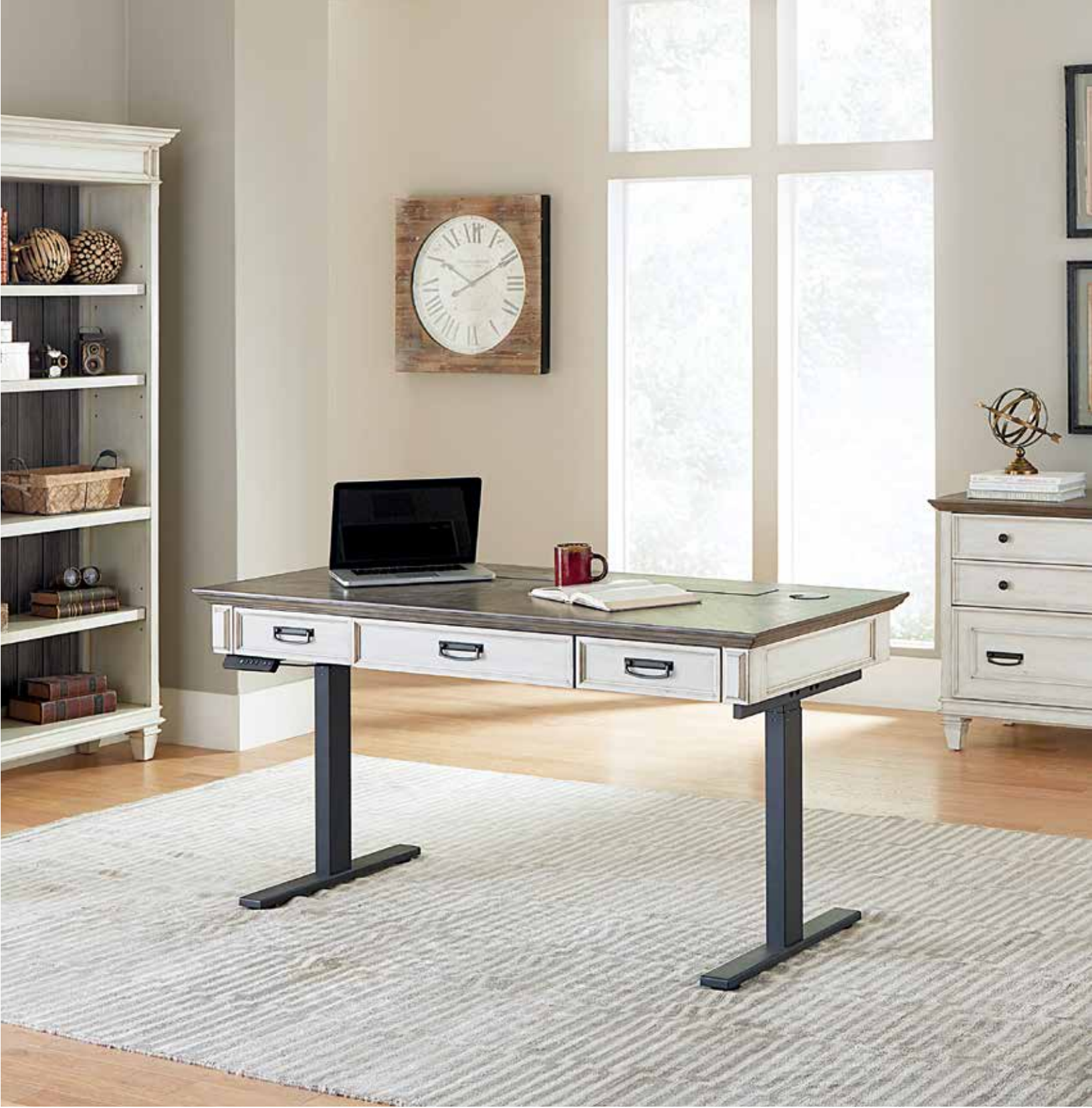
HARTFORD Linen White finish has a contrasting gray patterned top