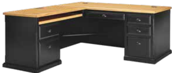
DESK FOR RIGHT HAND FACING RETURN* SO684R - 68.25w x 30h x 32d Locking letter file drawer, Pencil drawer, Two wire management grommets