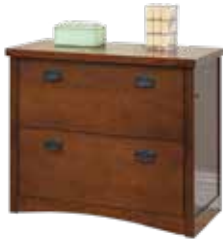
LATERAL FILE MP450 - 33.75w x 29h x 19.5d Two legal/letter file drawers, Top drawer locks