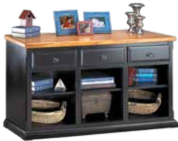
THREE DRAWER CONSOLE SO573 - 57.5w x 30h x 20d Three adjustable shelves, Three utility drawers