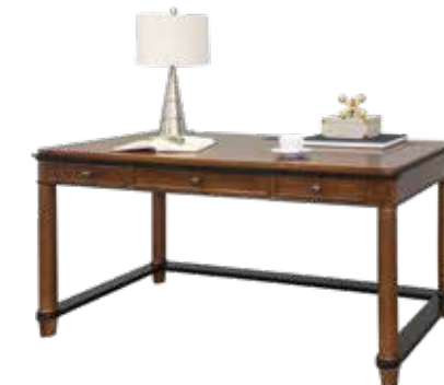
WRITING DESK IMKE384 - 60w x 31h x 30d Drop front keyboard/pencil drawer, Two utility drawers, Two wire management grommets, Power center with two AC power outlets & three USB 2.0, Requires minor assembly