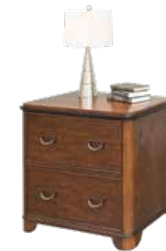
LATERAL FILE IMKE450 - 33.5w x 32h x 22d Two locking legal/letter file drawers

C / HUTCH IMKE682 - 68w x 45h x 14d One adjustable glass shelf behind each glass door, One adjustable center shelf, Touch activated lighting system