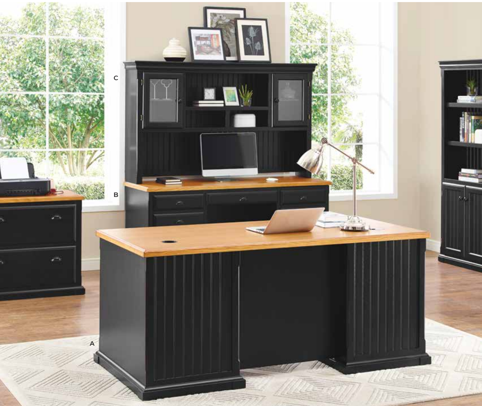
A / DOUBLE PEDESTAL DESK SO680 - 68.5w x 30h x 32d Two locking legal/letter file drawers, Two wire management grommets, Conference overhang

Southampton is a charming and comfortable home and office collection. Southampton is constructed with hardwood solids and veneers, and embodies the warmth of a sun filled cottage with a slightly distressed, painted Onyx Black finish with oak tops.