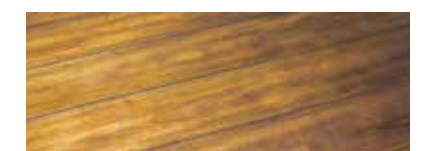
Wood plank top on Black Rub