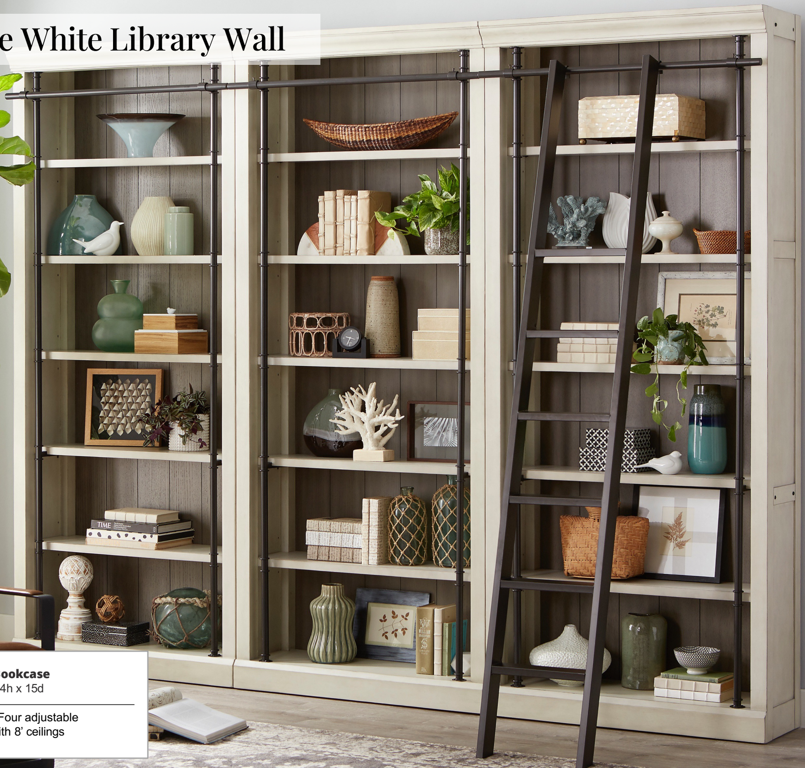
Toulouse 94" Tall Bookcase IMTE4094W - 40w x 94h x 15d

One stationary shelf, Four adjustable shelves, Fits rooms with 8' ceilings